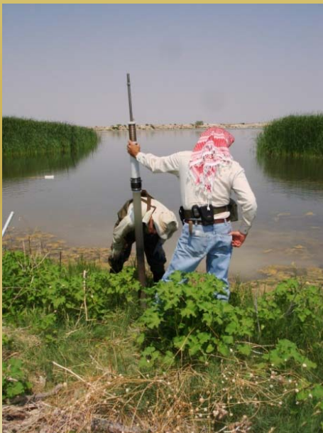
Figure 2. Sampling Peterson Reservoir.